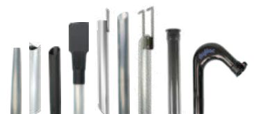
ELITE END TOOLS, ALU SCRAPER TOOL, STRAIGHT END TOOL & VIPER TOOL