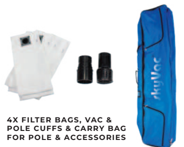
4X FILTER BAGS, VAC & POLE CUFFS & CARRY BAG FOR POLE & ACCESSORIES