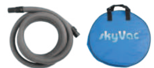
8M (50MM) FLEXI HOSE & HOSE BAG